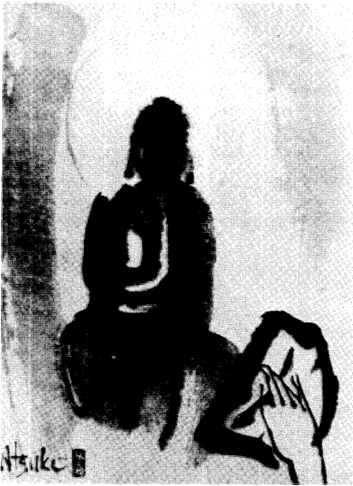
No. 11 Polishing and the Buddha appearing in the mirror (Morikawa)