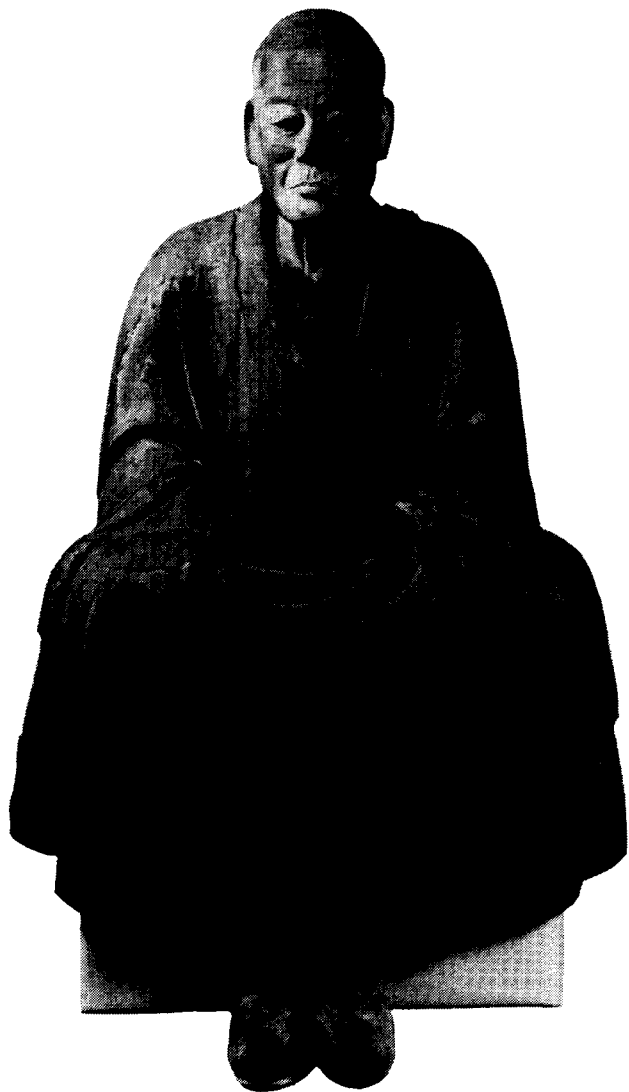
No. 8 Zen master Daikaku shortly before his death