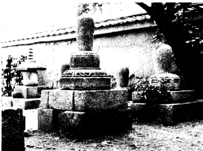
No. 1 The Grave of Shunpō

This was to be an edited and supplemented edition of the Shōnankattōroku.