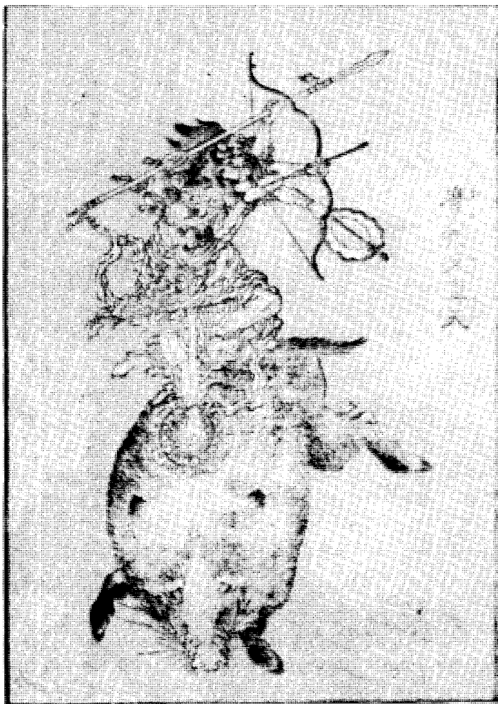
No. 12 Hokusai: The war-god Marishi (from India) using bow, spear, sword and fan with his various arms without confusion, while balancing on the back of his 'vehicle', a wild boar. This is to illustrate ki filling the whole body and each single function without being concentrated to the detriment of the others. (British Museum)