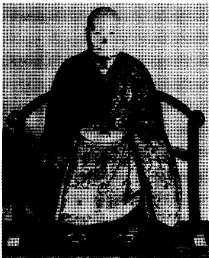
No. 14 Princess Yōdō, fifth abbess of Tōkeiji (International Society for Educational Information, Tokyo)