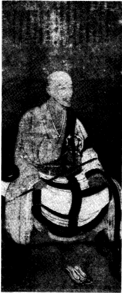
No. 4 Zen master Daikaku