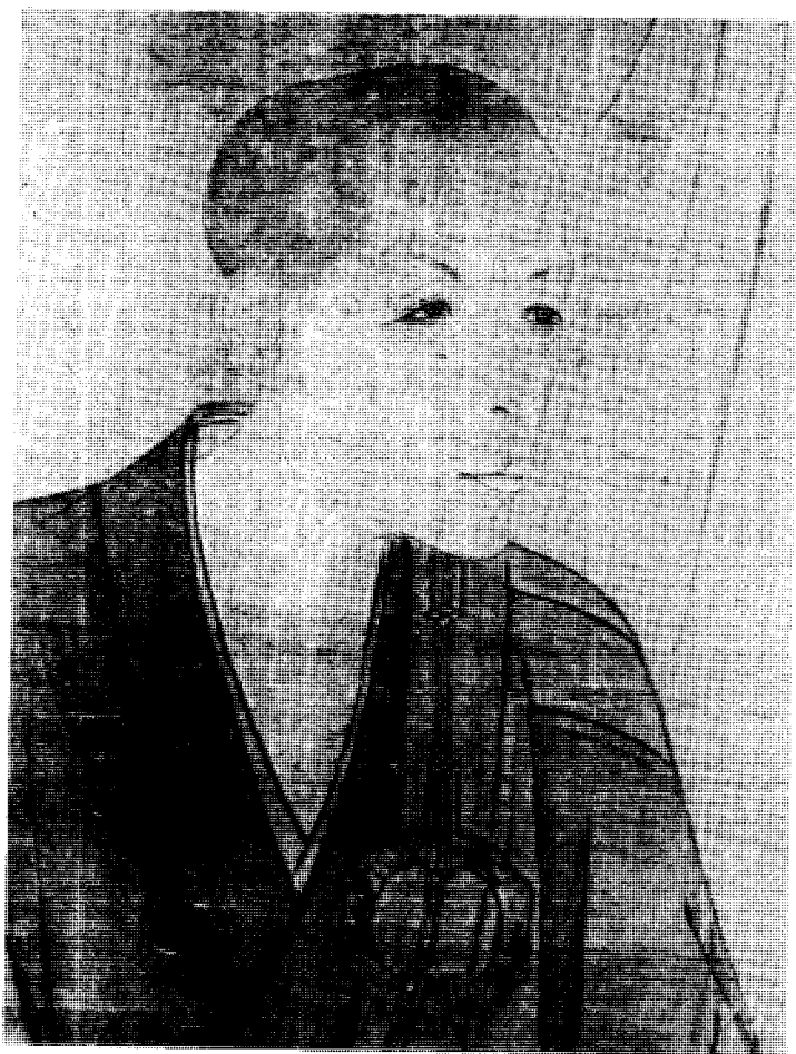
No. 3 Zen master Daikaku (Rankei) (1213–79) painted in 1271, when he was fifty-eight, and had been in Japan twenty-five years

follower of Zen want with a long text? If you want to recite the Zen sūtra, do it with one word . It is the six- and seven-word ones which are too long.'