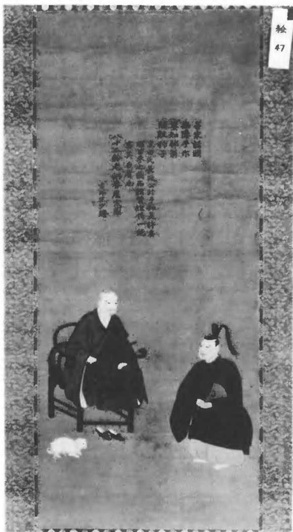
A very unusual picture of an interview in the fourteenth century between the feudal lord Kuroda and a Zen master on the kōan 'Is there Buddha nature in the dog?' 'No'.