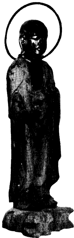
No. 5 Jizō stands up