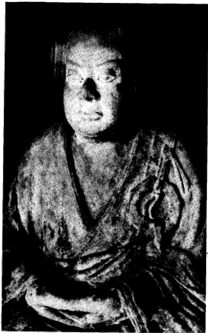
No. 2 Regent Hōjō Tokiyori