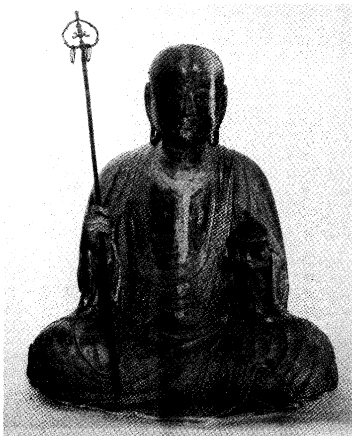
No. 6 Jizō sits

When Nitta Yoshisada's soldiers were burning the countryside in 1331, they attacked the Kamakura temples with fire, and Kenchōji was set alight. It is said that the monk in charge of the main hall put the great image of Jizō on his back and