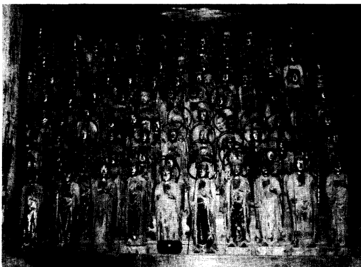
No. 9 Jizō of a thousand forms

into Chinese characters, and the Japanese, not knowing the colloquial Szechuan phrase, took it in a literal sense – Tr.)