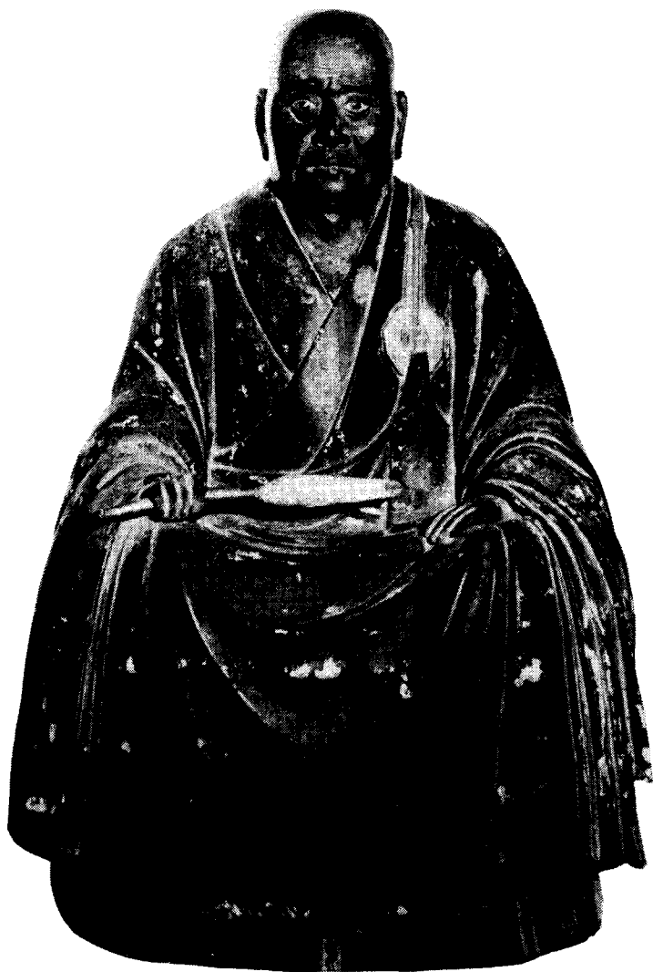
No. 13 Master Butsujō