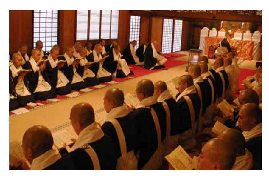
FIGURE 1. Jörakue performed at Kongōbuji on 15 February 2003.

boundaries. The best-known and most often performed kōshiki by Myōe, as well as of the kōshiki genre in general, is the Shiza kōshiki.