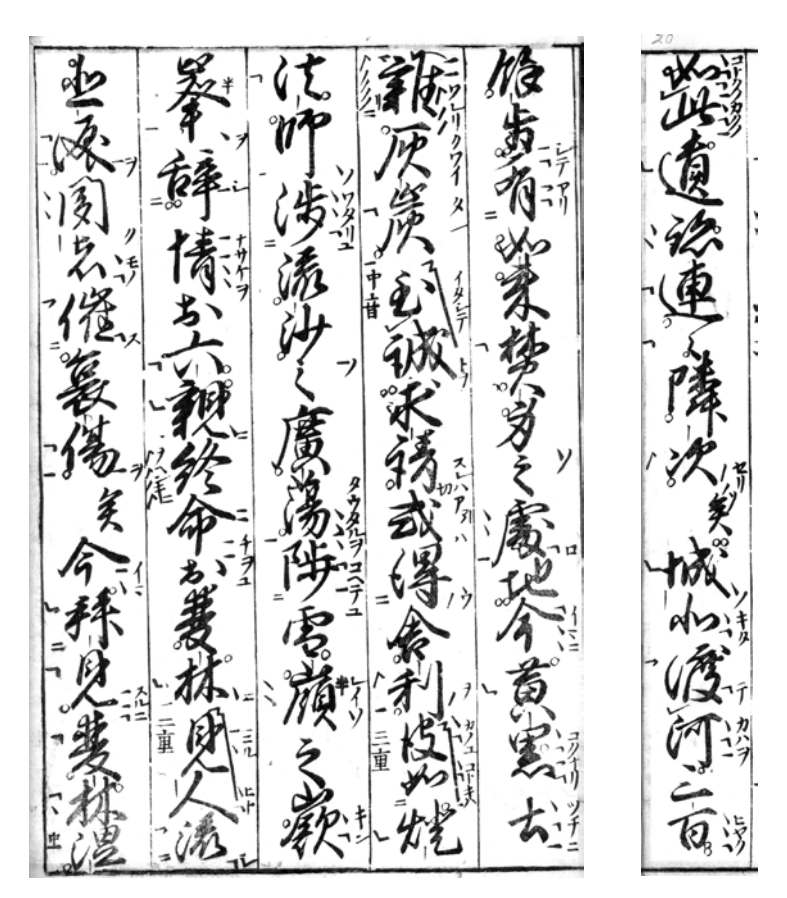
FIGURES 6a (right) and 6b (left): Excerpt from the Shiza kōshiki (1686). Reproduced with the permission of the Institute for Japanese Music Historiography of Ueno Gakuen University. The passage translated here begins in the lower half of the first line of image 6a (right) and ends in the middle of the last line of image 6b (left).