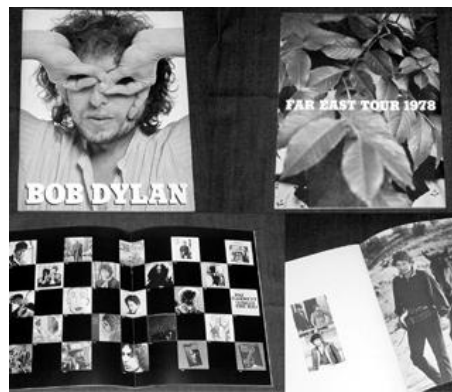
From '78 Far East/Budokan Tour Program

The Japanese people can hear my heart still beating in Kyoto at the Zen Rock Garden – Someday I will be back to reclaim it.