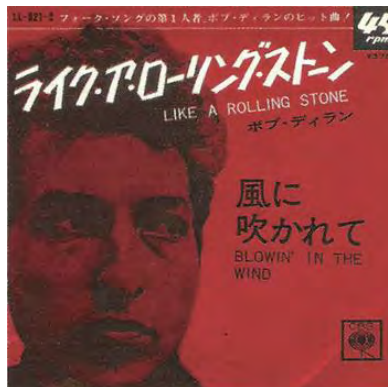
Dylan '60s Record Jacket in Japan

Dylan’s possible interest in a Zen outlook was no doubt greatly enhanced by his travels in Japan a decade later. Dylan’s music gained popularity and a cult following in Japan beginning in the ’60s when songs like “Blowin’ in the Wind” and “Like a Rolling Stone” were hit singles, and he became a role model for Japan’s student protest movement during the Vietnam War era.