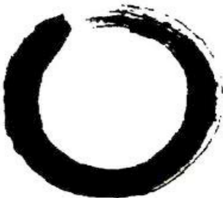
Figure 4. A Zen Ensō.