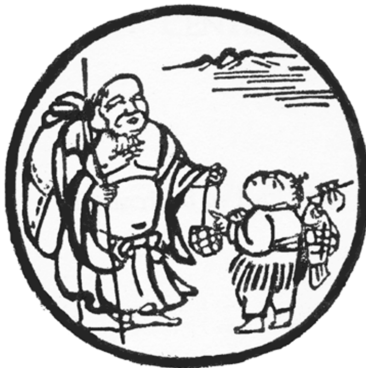
Figure 9. Tenth Ox Herding Picture: Entering the Market with Helping Hands. (from Nyogen Senzaki and Paul Rep, Zen Flesh, Zen Bones . Charles Tuttle).

In the spirit of Zen, the art of organizational maintenance might best be summarized by an image — the last of The Oxherding Pictures , "Entering the Market with Helping Hands" (see Senzaki and Reps, 1957). A classic Zen text from the 12 th century, The Oxherding Pictures visually illustrate the journey towards the full experience of awakening (see Figure 9 below). The series of pictures provides a map of the spiritual journey for the lost ox and the fruition of such a search. The ox, of course, symbolizes our true nature and authentic self, or the Zen notion of "no mind."