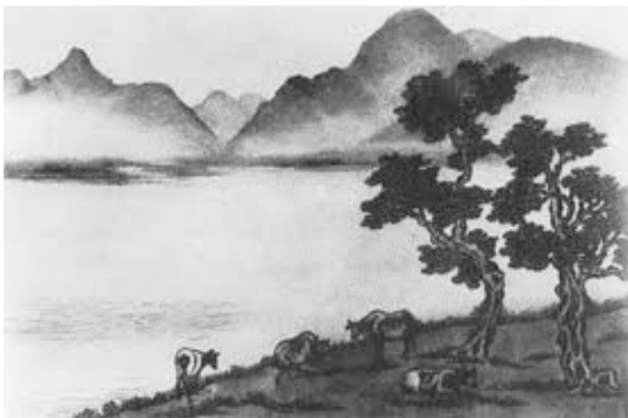
Figure 2. Chiang Yee's Cows in Derwentwater from The Silent Traveller, A Chinese Artist in Lakeland , first published in London in 1937.

The accommodating character and active expression of space in Chinese and Japanese landscape paintings also exhibits an active and inclusive engagement of the observer. In contrast, Western landscape paintings utilize unambiguous modes of linear perspective that posit a clear division between the observer and the observed, locating the viewer in a definite position outside of the painting (Purser 2000). In Chinese and Japanese landscape paintings, it is hard to locate the position of the observer (see Figure 2).