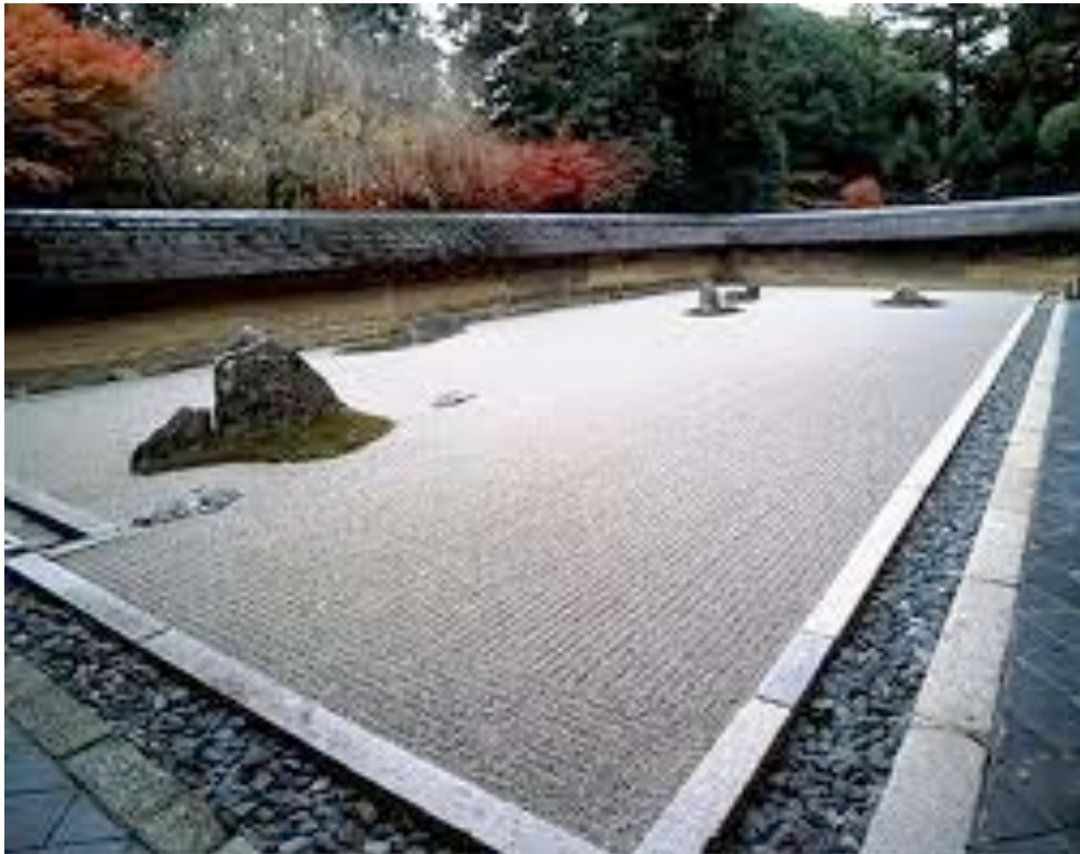
Figure 5 The Ryôan-ji Zen garden.

The most famous Zen garden, which has been the subject of innumerable interpretations, is the Ryoanji garden adjacent to a Rinzai Zen temple complex just north of Kyoto City. Originally built in 1450, it was reconstructed in 1486 after a fire. Ryoanji is relatively small rock garden, 10 x 30 meters in size (see Figure 5 below), consisting of 15 rocks of various sizes and shapes that sit arranged in raked grey gravel. The garden is backed by a low stone wall along the perimeter, and is open to the southern side of the main temple hall's wooden veranda. There is no plant life introduced into the garden itself except for the moss that grows by the base of the rocks.