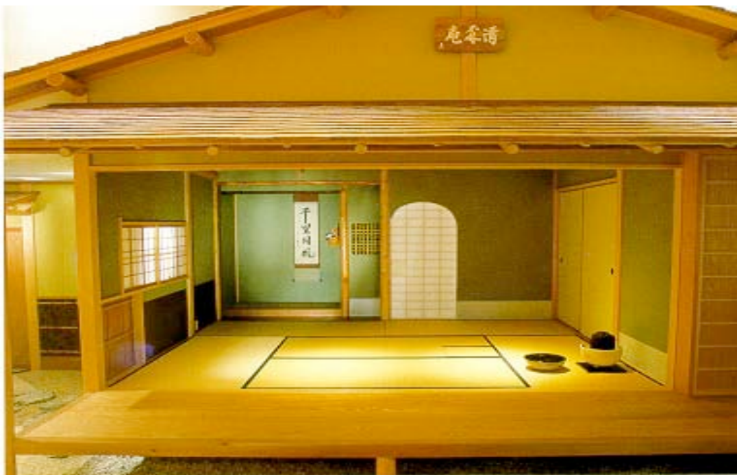
Figure 1. A Traditional Japanese Tea House

The tea ceremony ( cha-no-yu ) has had a profound influence on Japanese culture and aesthetics. The principle of simplicity is at the foundation of the Zen aesthetic. Hisamatsu (1971:30) characterizes kanso (simplicity) as “being sparse, not cluttered.” The tea ceremony integrates many of the Zen arts: architecture, flower arranging, landscape gardening, ceramics, and metalwork. Tea, of course, was imported into Japan in the 9 th century by monks for use as a stimulant during their long meditation periods. Eisai is credited with creating the monastic tea ceremony. However, it wasn’t until the 16 th century, by the time the Zen arts were flourishing, that Senru Rikyu (1518-1591) refined the tea ceremony into a secular offering for the Samurai and Shogun.