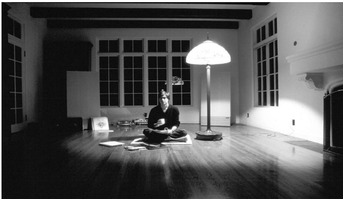
Figure 7. Jobs at his home in Woodside, CA (circa 1982).

A famous photograph taken by Diane Walker of Jobs in his Woodside, California home (circa 1982) reveals many of the Zen aesthetic principles discussed above (see Figure 7). The photo shows Jobs sitting in his sparse and simple living room with a cup of tea, resembling the simplicity and austerity of the Japanese tea house.