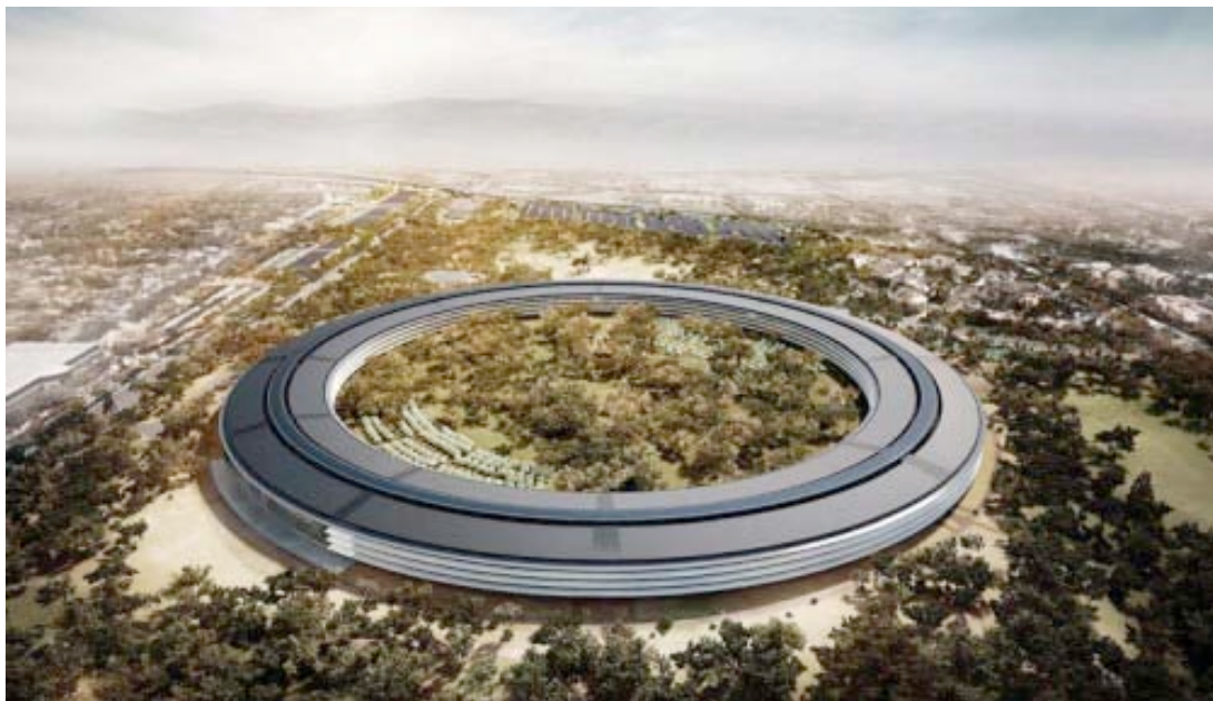
Figure 8. Aerial view of Apple's proposed new headquarters in Cupertino, California.

Jobs' love for simplicity and minimalism was reflected in his subtractive approach in both design and product development. "Deciding what not to do is as important as deciding what to do," Jobs remarked. Furthermore he suggested, "That's true for companies, and it's true for products"(quoted in Isaacson 2011:336). For example, Jobs eschewed on/off power buttons on Apple products and even removed buttons on elevators in multilevel Apple stores. Noting this obsession with simplicity, Isaacson (2011:389) states: "The most Zen of all simplicities was Jobs' decree, which astonished his colleagues, that the iPod would not have an on-off switch. It became true of most Apple devices." Jobs also insisted that the iPhone not include a keyboard. He pressured his product design team to simplify song selection, resulting in the elegant trackwheel on the iPod (which coincidentally resembles the Zen ensō circle). Jobs personally became involved in the architectural design of the new Apple campus, an engineering feat of circular glass panels (see Figure 8).