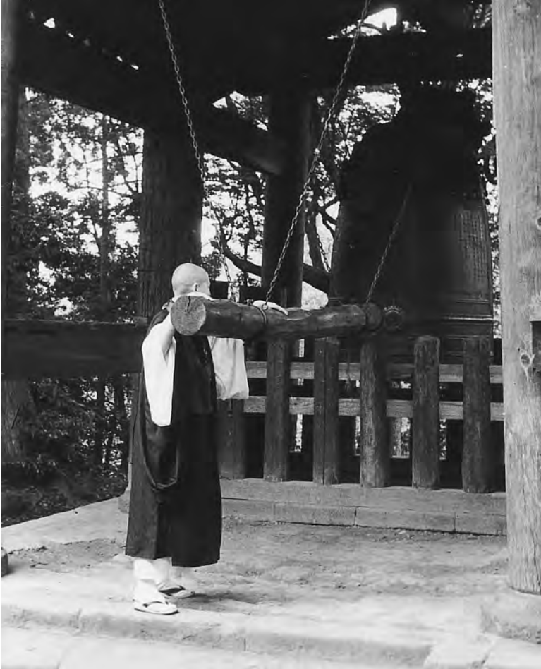
The author ringing the great bell of Dai Hon Zan Sōjiji when in training. The bell tells the hours of 11 A.M. and 3 P.M.; between these hours visitors may enter the monastery.

Outside of this doubting self no world exists for the world actually is this very self: all things in this world must be regarded as time and all things are in the same unhindered relationship, one with the other, as in each moment of time. Because of this the longing for enlightenment arises naturally