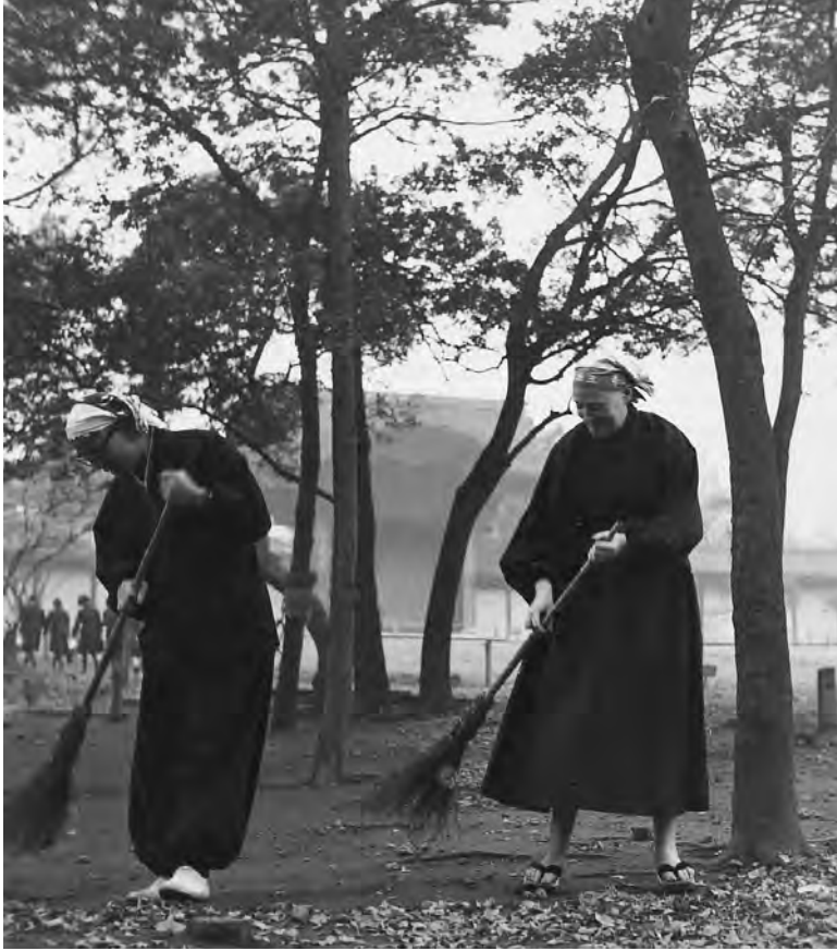
Before breakfast all the trainees carefully clean the monastery grounds. Here the author sweeps leaves in the grounds of Dai Hon Zan Sōjiji. The gate for the Imperial envoy may be seen in the background.

section of the teaching should be deeply appreciated. What alternative have we but to be utterly grateful for the great compassion exhibited in this highest of all teachings which is the very eye and treasury of the Truth? The sick sparrow never forgot the kindness shown to it, rewarding it with the ring belonging to the three great ministers, and the unfortunate tortoise remembered too, showing its gratitude with the seal of