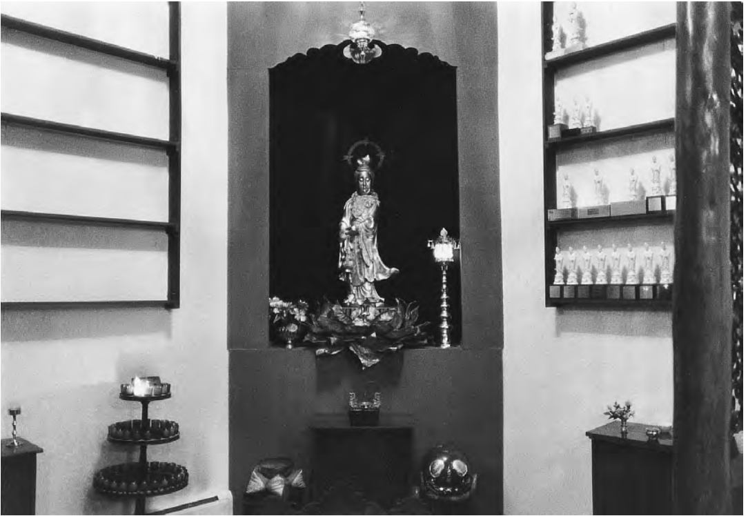
The statue of Avalokitesvara, the compassionate aspect of the Buddha, at Shasta Abbey. The Hall is also used as a Tombstone Hall. This particular hall is commonly used for housing memorials of the dead in eastern temples.

lay student must search within himself for a means to benefit mankind throughout the world. He must find within himself the strength of a thousand arms and the sight of a thousand eyes. He must so cleanse his heart that no attachment to anything of his old selfish self remains within him and this is done by the power and training of the meditation I described in the previous chapter. But he must not train for the sake of helping others only, nor for the sake of helping himself. He must just train for training's sake and nothing more. In some ways this type of meditation could be called brainwashing for it is a constant criticism of oneself in the minutest details, but it is brainwashing with the difference that it is done by one's own wishes and not by those of another.