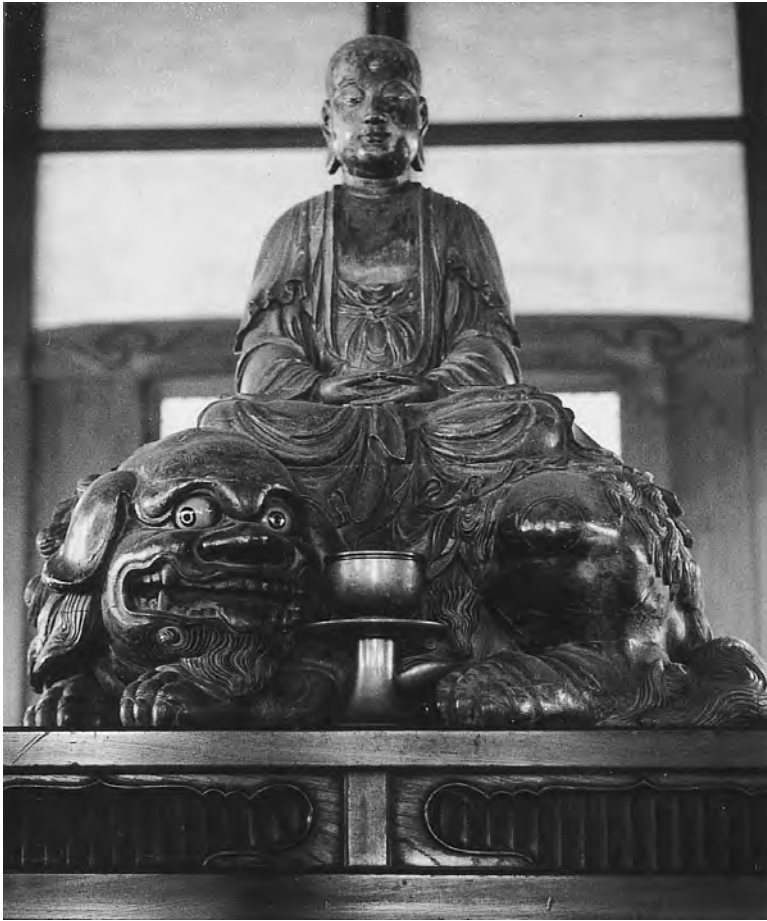
Manjusri seated in meditation upon the beast of self which never sleeps. This particular statue is in the Meditation Hall of Dai Hon Zan Sōjiji where the author spent seven years in training.

statue. It is forbidden to lie on the face or back with the knees up or the legs crossed. The legs may not be stretched out, the night clothes may not be pulled down and the body may not be stripped as is the fashion amongst the unbelievers. At all times, when lying down, our minds must be filled with light as brilliant as that of the heavenly beings.