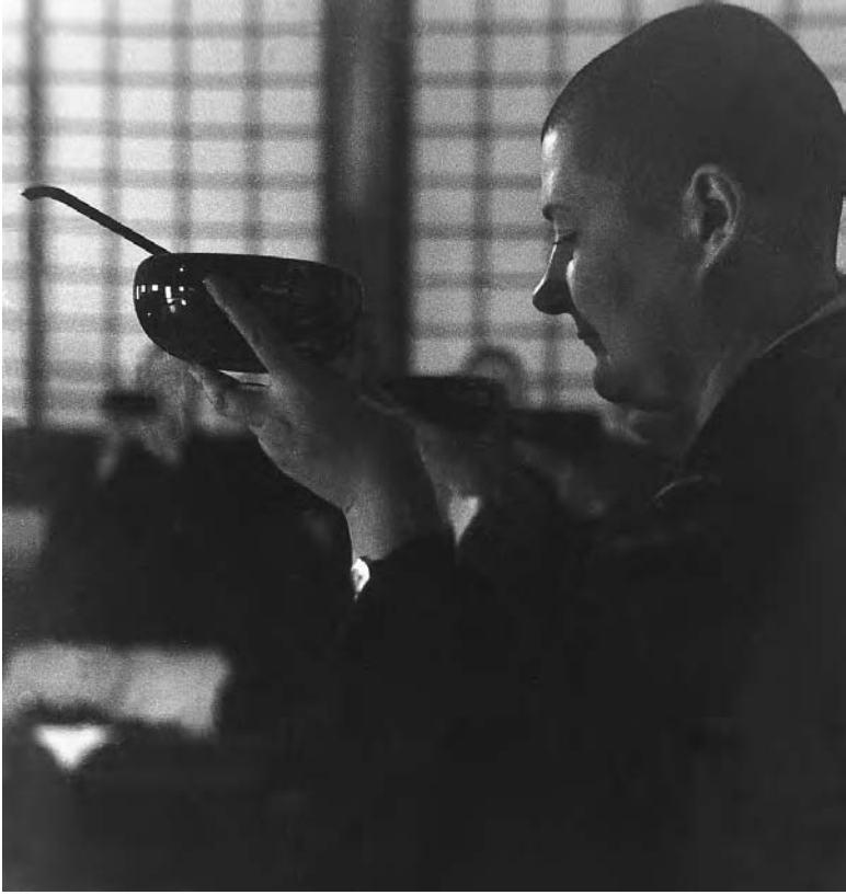
All meals in large temples are taken formally in the Meditation Hall. Here the author eats formal breakfast in Dai Hon Zan Sōjiji.

middle with the spoon. Only sick trainees may ask for extra food. The extra bowls may not be filled with rice, nor may a trainee look into a neighbour's bowl or disturb him. Lunch must be eaten carefully, large lumps of rice may not be crammed into the mouth nor may balls be made and thrown into the mouth. Not even a grain of rice that has fallen on the table may be eaten; the lips may not be smacked whilst chewing rice and it may not be chewed whilst drinking soup. The Buddha said that tongues must not be long nor lips be allowed