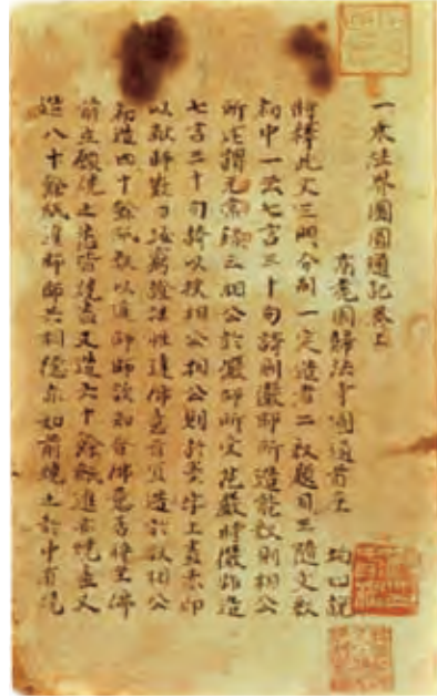
Left: The funerary pagoda ( pudo 浮屠) of Sólcham, Kim Sisüp. Right: Handwritten manuscript of the Ilšung pöpkye to wōnt'ong ki (in the possession of Dongguk University).