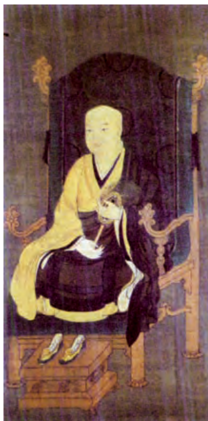
Portrait of Dharma Master Ūisang (in the possession of Kōzanji 高山寺 in Japan).