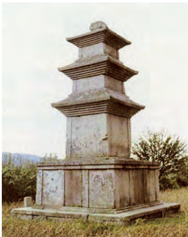
Stone pagoda at the site of Hwangbok Monastery, in Kuhwangdong, Kyōngju city, North Kyōngsang Province. National Treasure no. 37.