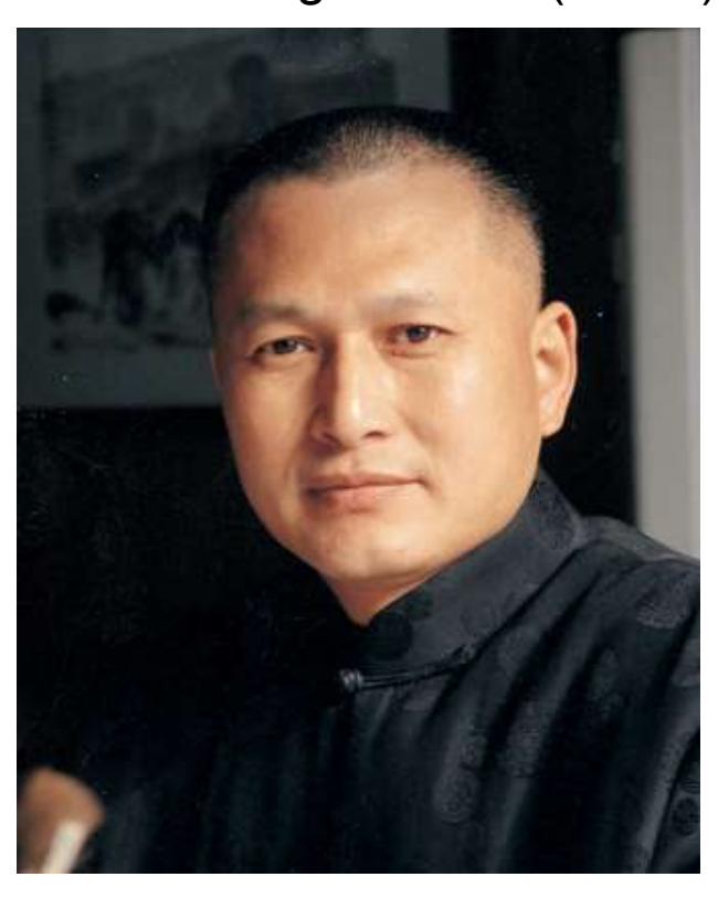
张友宪, 1954 年生, 1982

年毕业于南京艺术学院。现为南京艺术学院美术学院院长,南艺中国画研究院院长,中国美术家协会理事。