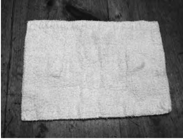
FIGURE 8.2 Zōkin : thick cleaning rag.