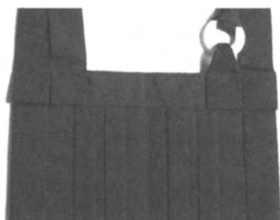
FIGURES 2a & 2b. A black rakusu purchased from a commercial robe store. It shows the style of sewing determined by the Sōtō shūmuchiō.

seams of each panel from top to bottom and on the long vertical seams from middle to the edges provides the characteristic wet-rice-paddy pattern ( densō 田相). In this metaphor, the water of the teaching of the Buddha flows from the upper to the lower edge and from the center to the periphery of the robe, just as the water flows in the rice paddy. In the Hōbuku kakusho Mokushitsu presents the metaphor as a simile: just as the water in the rice paddy nourishes the growing plants, the shape of the robe illustrates the Buddha's teaching nourishing the aspiration of the practitioner (KAWAGUCHI 1976, p. 140).