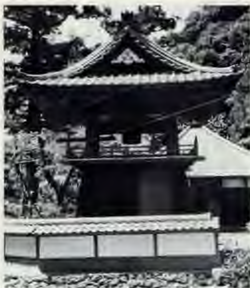
Bell tower at Rinso-in