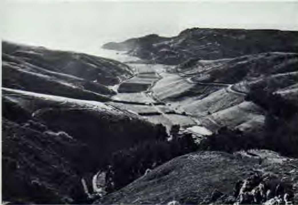
The Zen Farm Center in the Green Gulch Valley

There is a fairly large house, built on an old hay platform, that has five bedrooms; a big kitchen and a small kitchen; a library or office; and two large sitting rooms with fireplaces, one opening onto a deck above the garden and one opening onto the garden. Next to the big house there is an enclosed swimming pool and sauna. There is also a small bunkhouse; a double trailer with three bedrooms; and a ranch house with four bedrooms, a large studio, and a large sitting room. Probably the best for us is the oldest building, a huge barn with two ground level floors, the upper one the perfect size and proportions for a traditional Zendo.