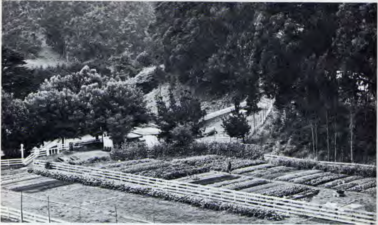
Garden at Zen Farm Center