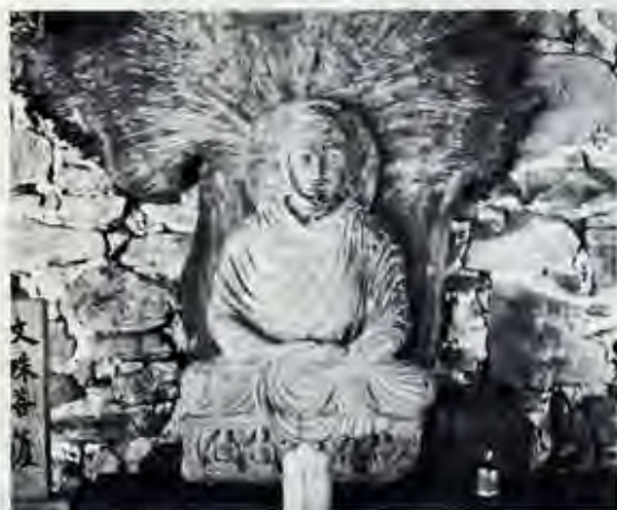
Gandhara Buddha, Tassajara