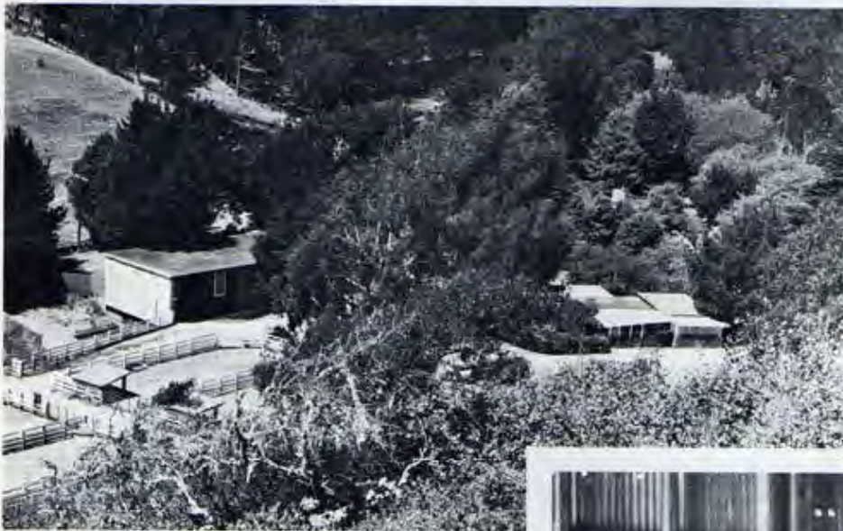
The Barn Zendo, Farm House and roof of Main House