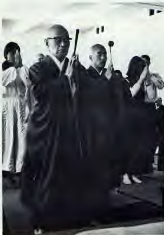
Lay Ordination, August 1971