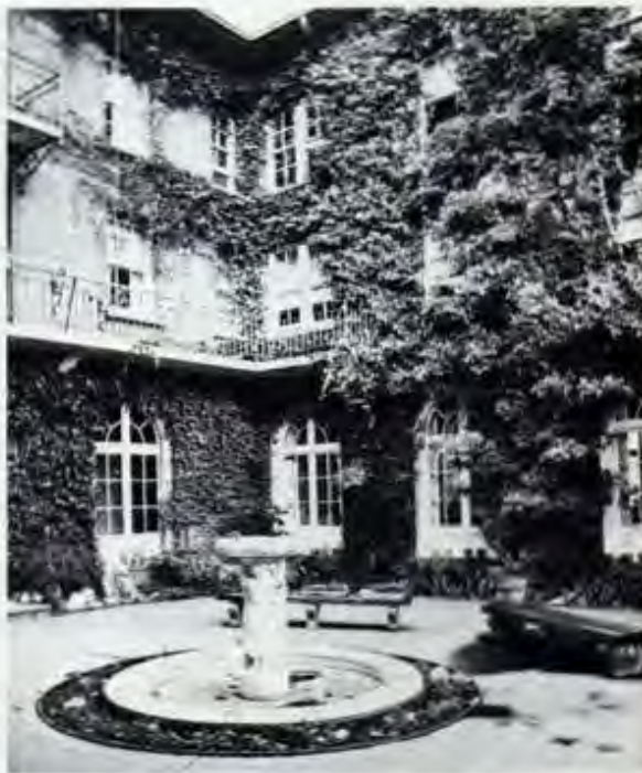
City Zen Center courtyard

CITY ZEN CENTER The new Zendo in the building has been finished for a little over a year. The new City Practice Periods have already been discussed in