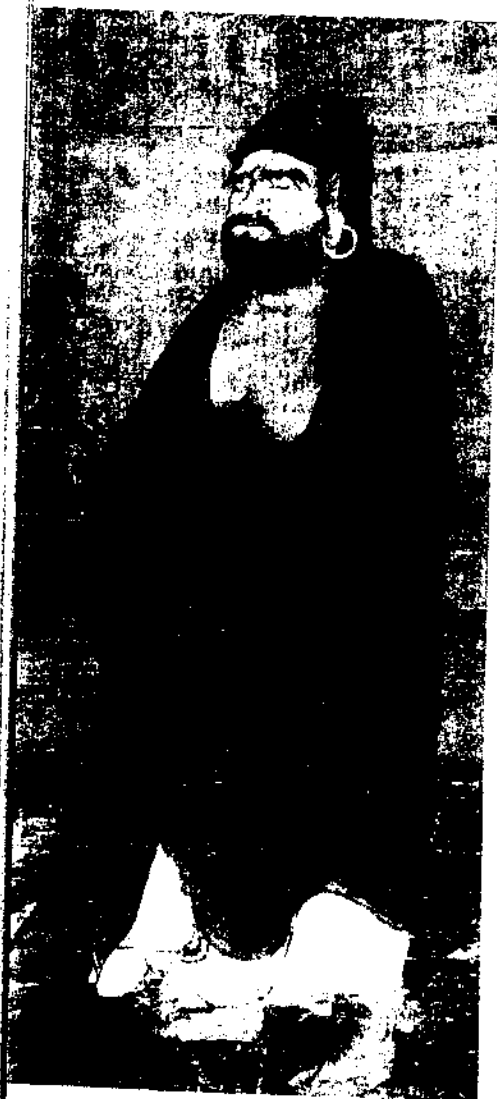
Figure 1. Bodhidharma on a Reed (detail), 14th c. Hanging scroll; color on silk; 102.4 × 38.5 cm. Anon.; inscription by Kozan Ikkyō 固山一峯 (1295–1360). Gyokuzō-in Temple, Kyoto.