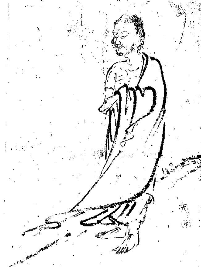
Figure 11. Shussan Shaka , 13th c. Anon. Hanging scroll; ink on paper, 90.8 × 41.9 cm. Seattle Art Museum, Eugene Fuller Collection (50.124).