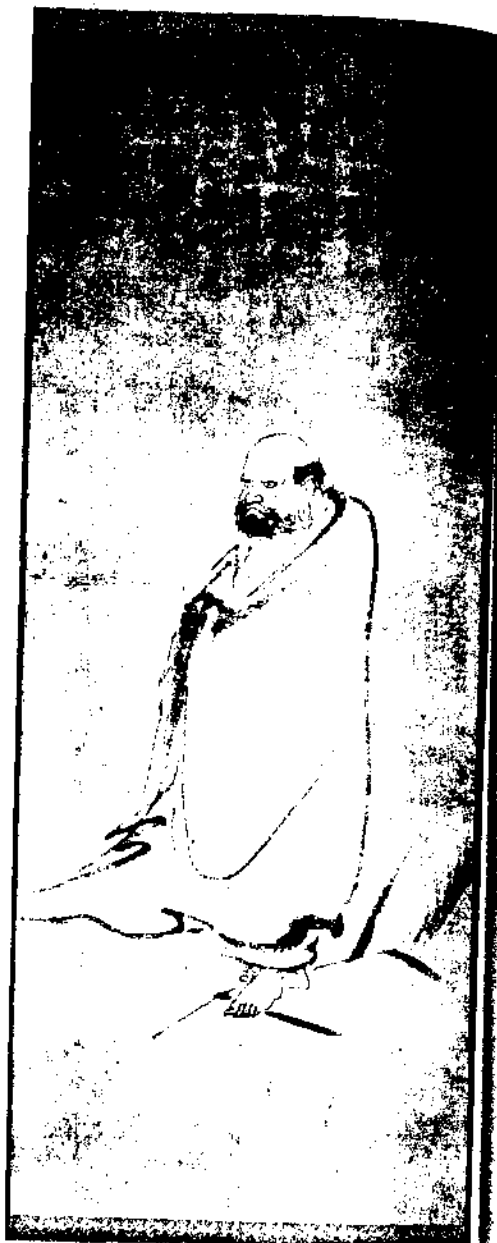
Figure 2. Bodhidharma on a Reed (detail), 14th c. Hanging scroll; ink on paper; 89.2 × 31.1 cm. Anon.; inscription by Liao-an Ch'ing-yü 了庵清欲 (1288–1363). Cleveland Museum of Art, John L. Severance Fund, 64.44.