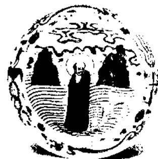
Figure 4. Bodhidharma on a Reed , late-16th c. Dish painted in underglaze blue and colored enamels. Topkapi Saray Museum.