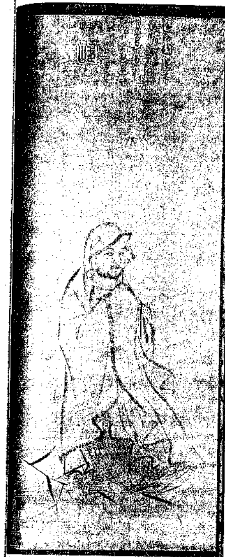
Figure 12. Bodhidharma on a Reed Hanging scroll; ink on paper, 85.6 × 34.21 cm. Yao-fu 李翹夫 (13th cent.); inscription by Ishan I-ning 一山一寧, (1247–1317). Metropolitan Museum of Art, Dillon Fund Gift (1982.1.2).