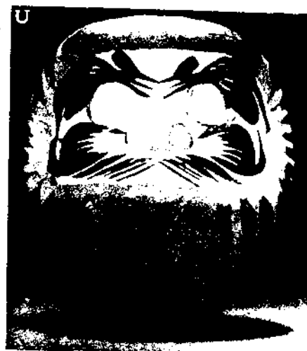
Figure 14. Daruma Doll , 20th c. Painted wood; 15 cm. Shibumi Trading Company Brochure.