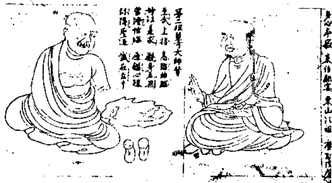
Figure 6. Portraits of Patriarchs and Teachers from Three Countries (detail), dated 1130. Handscroll, ink and light color on paper. Daigoji, Kyoto.