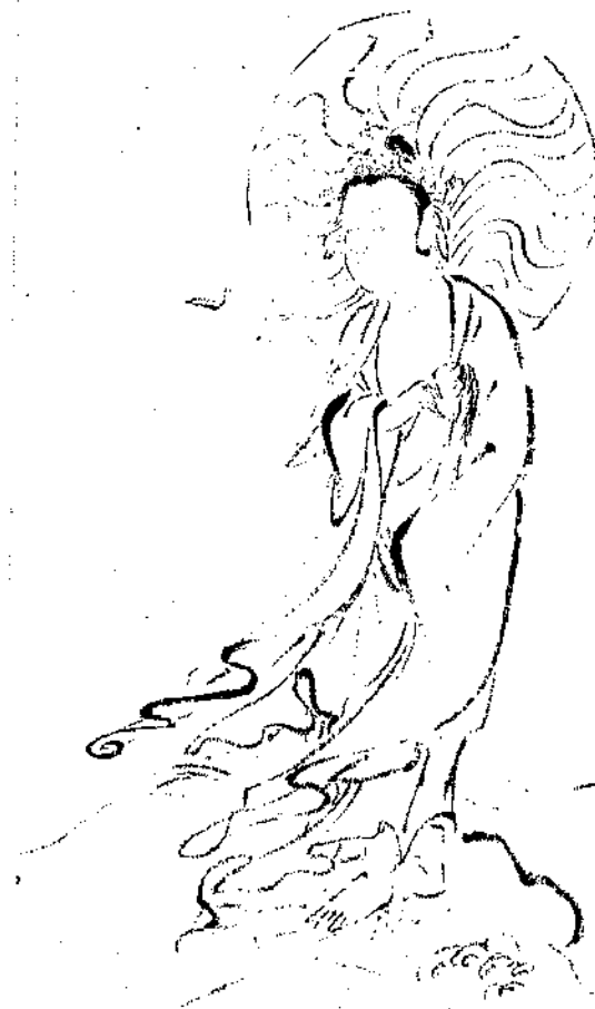
Figure 13. Kuan-yin with a Willow Branch , 13th c. Anon. Hanging scroll; ink on paper, 91.1 × 43.7 cm. Private collection.