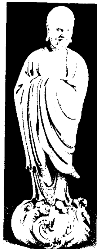
Figure 3. Bodhidharma , ca. 1650–1700 Blanc-de-chine porcelain. Peking Palace Museum.