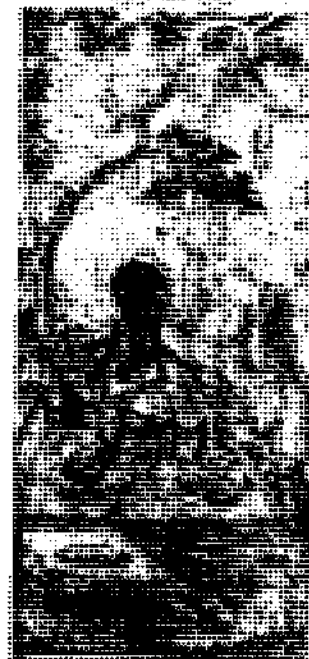
Figure 5. A Long Roll of Buddhist Images (detail), 1173–1176 Handscroll; ink, colors and gold on paper; 30 × 1881.4 cm. Attr. to Chang Sheng-wen 張勝溫 National Palace Museum, Taipei.