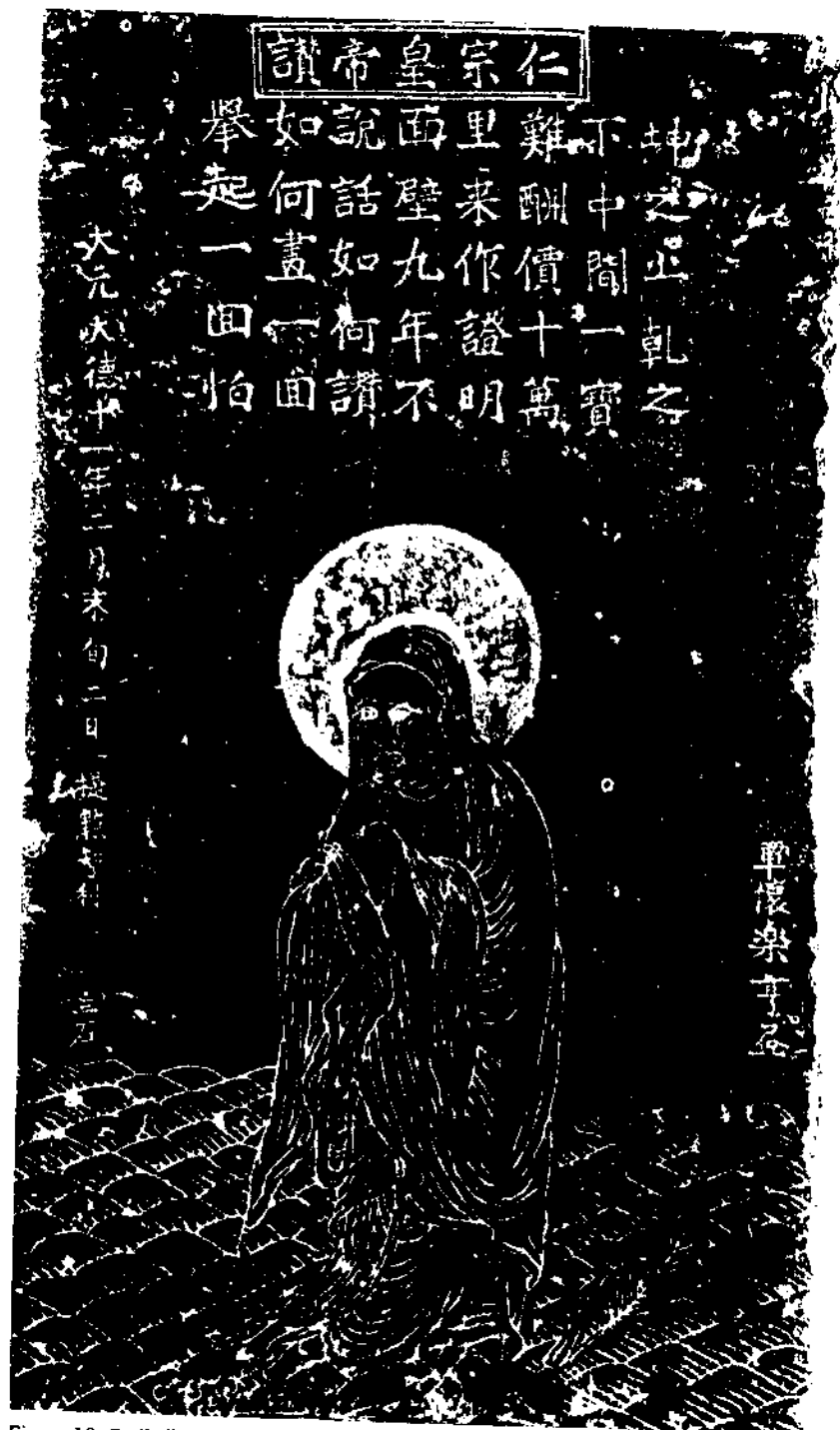
Figure 10. Bodhidharma on a Reed Rubbing from a stele engraving of 1308. Shao-lin Monastery, China.