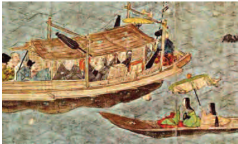
Painting of Honen saving a prostitute (fourteenth century)