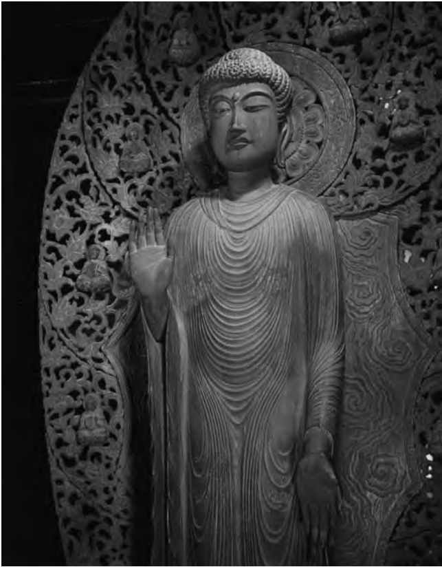
The Buddha (Śākyamuni) – secular name Gautama Siddhartha (A Seirōji-style image of Śākyamuni enshrined at Saidaiji, Nara.)