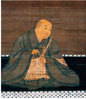
Hōnen (1133–1212) holding a Buddhist rosary (prayer beads)