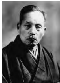
Makiguchi Tsunesaburō (1871–1944)