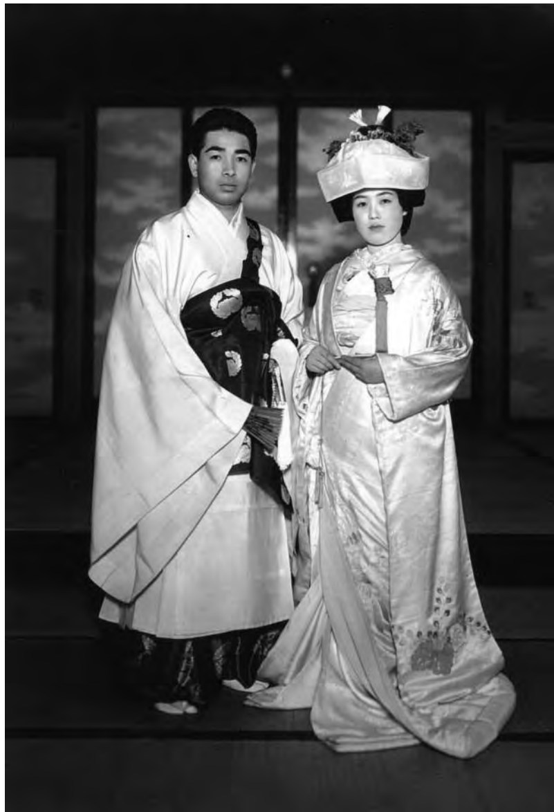
A monk's wedding ceremony