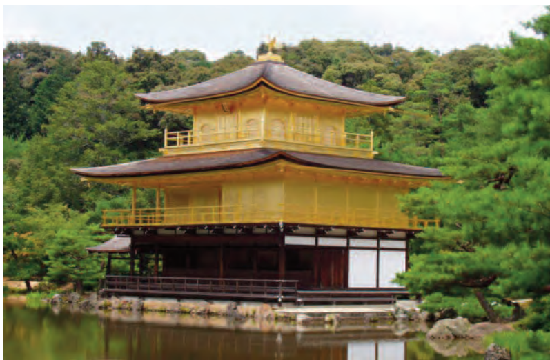
Kinkūji ('Golden Pavilion')