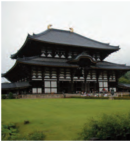
Daibutsuden, Nara (rebuilt 1709)