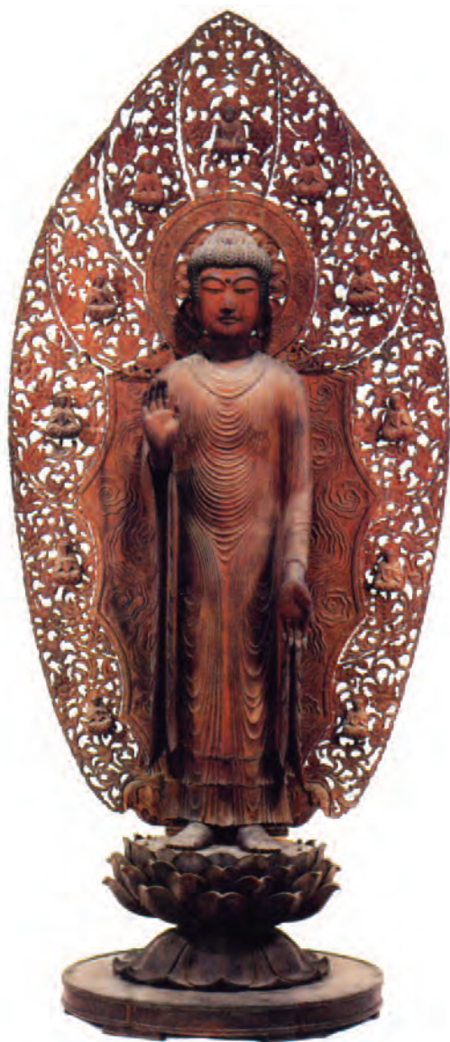
The statue of Sakyamuni in Saidaiji