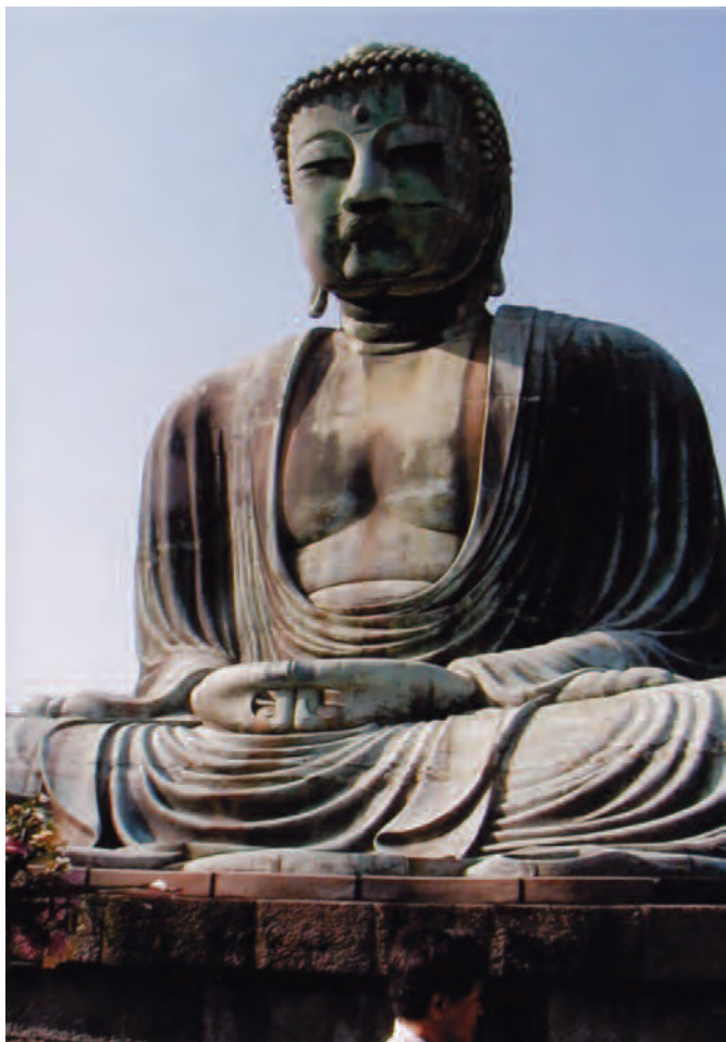
The Great Buddha of Kamakura (thirteenth century)