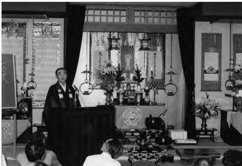
A monk preaching