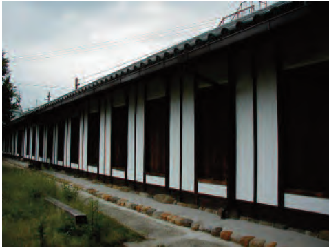
Kitayama Juhachi Ken Do (sanatorium for leprosy patients built by Eizon's order of monks, founded in the thirteenth century)