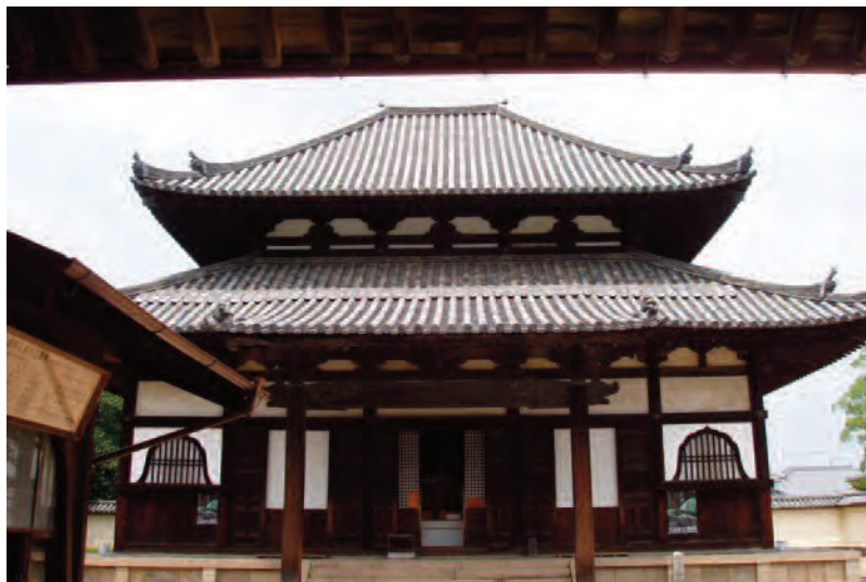
Kaidanin in Todaiji (rebuilt 1732)