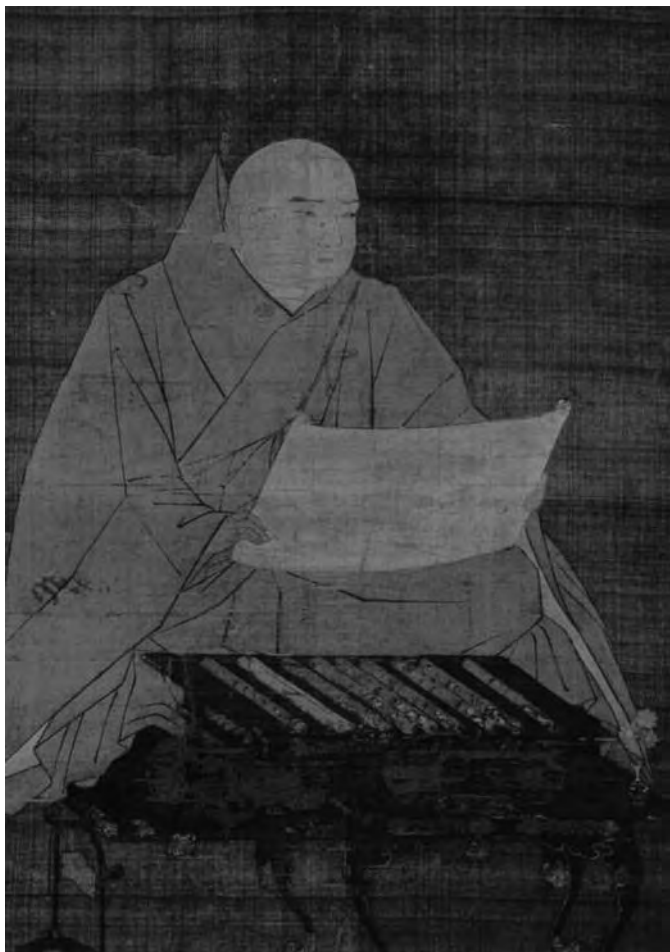
Nichiren (1222–82) reading a sutra from a scroll (thirteenth century)