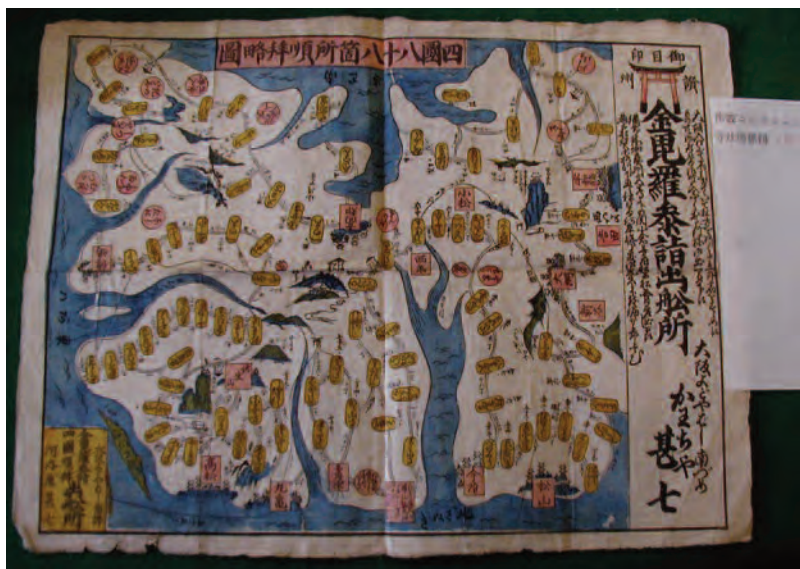
Shikoku pilgrimage map (eighteenth century)