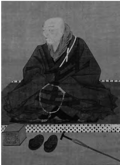
Shinran (1173–1262) holding a Buddhist rosary and sitting on tatami