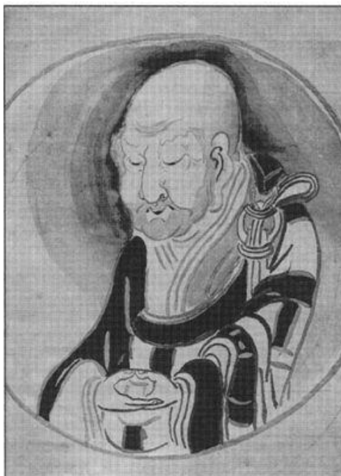
Self-Portrait by Hakuin