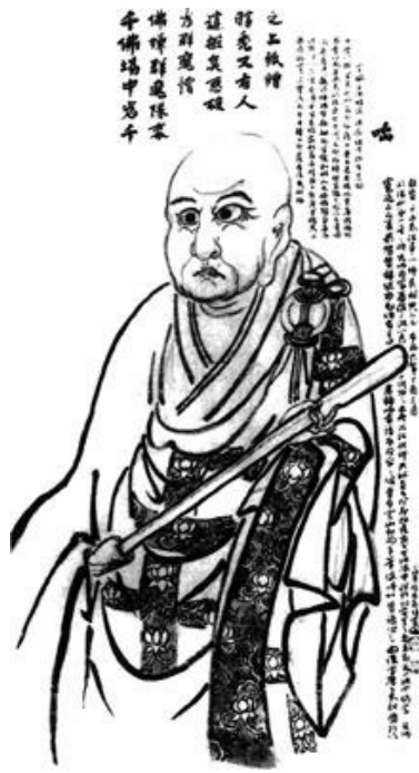
Self-Portrait by Hakuin