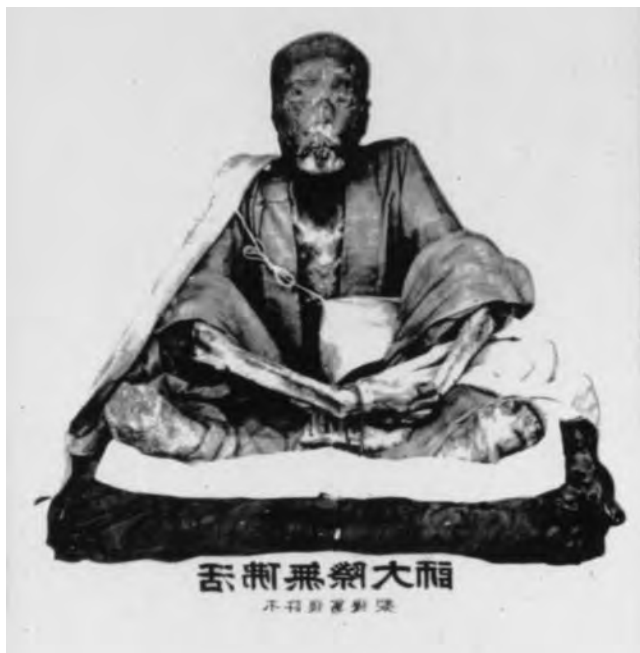
Figure 1 The 'Living Buddha' Master Wuji on display at the Taishō Exhibition in 1916.

sponsored a number of special viewings [ kaichō ] of the mummy throughout Japan. 22 Later, responsibilities for administration of the 'Association for the Reverence of Master [Wuji]' were taken over by Hirano and Yamazaki and they moved the mummy to Aoume, where the Mt. Sekitō Temple was eventually founded.