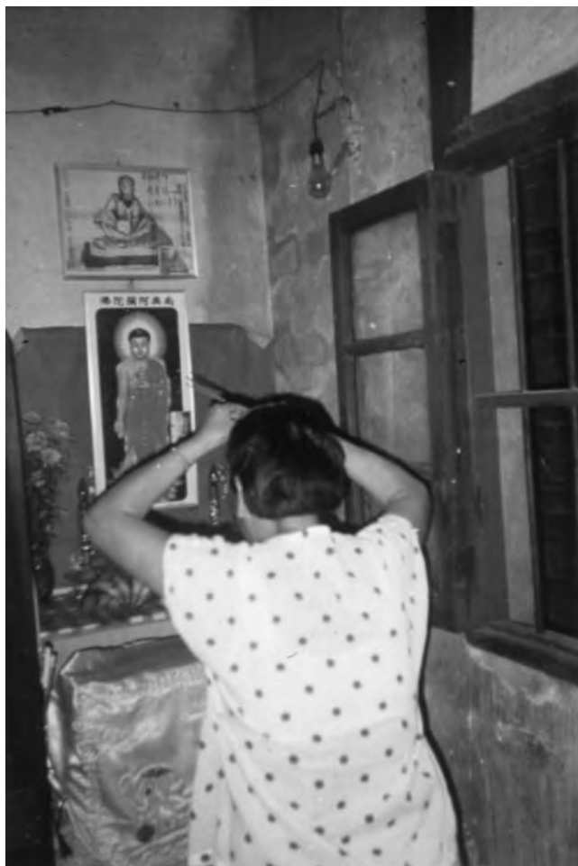
Figure 2 Image of Master Wuji being venerated inside the home of a devotee in Fujian, 1997.

mummy began to spread throughout the area. One striking example of this renewed piety is the spread of photocopy reproductions of the picture of the Wuji mummy (that was taken in Japan at the Taishō hakuran kai exhibition) that have been propagated widely and even found their way onto the altars (in the highest position of honour no less) in people's homes throughout the village.